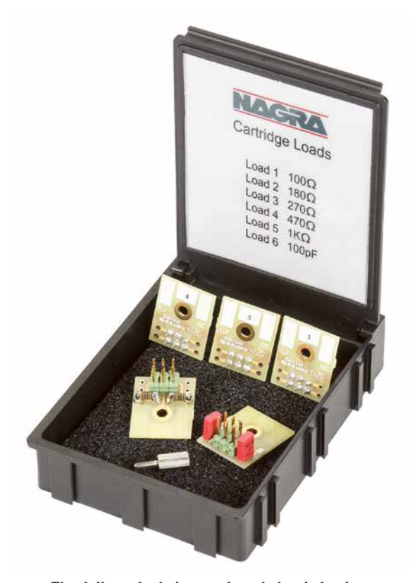
The delivery includes numbered plug-in load circuits for the adjustment of input resistance or capacitance with appropriate values. Custom designs are also available.

The precisely calibrated level meter called "Modulometer" is a typical feature of Nagra devices. It can be dimmed in several steps by a tiny switch, in correspondence with a cute little sun and cloud symbols. On the scale of the modulometer, you can see how high the current output level of the Classic Phono is on average. In conjunction with MM and MC cartridges of typical output voltages, the pointers will hover around the mark of minus ten decibels. When using particularly "quiet" MCs or certain high-output MCs - which run on the MM input, as we all know - the level of the tube-supported output stage can be raised by ten dB. This process then provides proper and usable voltages to the following amplifier. "Gain High" should only be used in these previously mentioned cases, in which it makes the performance punchier and more accentuated. Together with normal MM and MC pickups, however, this setting gave the performance a slightly stressed vibe - recognizable by the indicators swinging above "0 dB". If in doubt, just try it out!